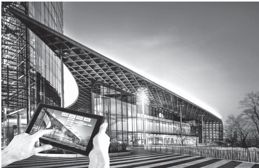
Building management with a tablet computer: In several modern office buildings, lights, louvers (blinds) and doors can be centrally controlled via the Internet. That brings gains in efficiency – but it holds risks, as well.

In their analysis of Botnet attacks, the researchers sketched out definitive threat scenarios for smart homes. "From my perspective, the most compelling issue is 'monitoring,'" the cyber defense researcher says. When the attacker hacks into the building operations IT, he or she will learn where the residents or tenants are located and what they are doing, in a worst case scenario. That includes everything, right down to going to the toilet. Intruders, for example, could use this data in order to prepare for a burglary or raid. In this case, the hacker is acting in a passive capacity, simply tapping data. However, he or she could be equally capable of actively invading the systems. Take a contractor from the energy industry, for example. He could profit from more oil or gas sold if the consumption of multiple heating systems is artificially elevated. A recent example demonstrates how real this scenario is: Last year, there was a gap in the security system of a heating system connected to the Internet. Attackers had the ability to shut down or damage heaters. Therefore, security expert Wendzel is currently advising against carelessly linking all building functions in private homes to the Internet.