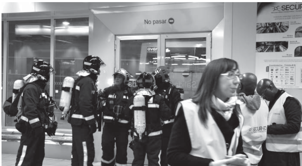
The EU research project, Secur-ED, aims to achieve greater security at Europe's train stations. Here, fire department staff can be seen on a test run in Madrid. (© Secur-ED) | Picture in color and printing quality: www.fraunhofer.de/press

The closing conference of Secur-ED ( www.secur-ed.eu ) takes place on September 17 in Brussels. In addition, the project will be presented at Future Security 2014, the security research conference in Berlin, from September 16 to 18 ( www.future-security2014.de ).