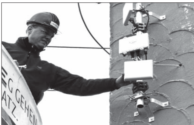
A researcher positions a WiBACK network antenna.