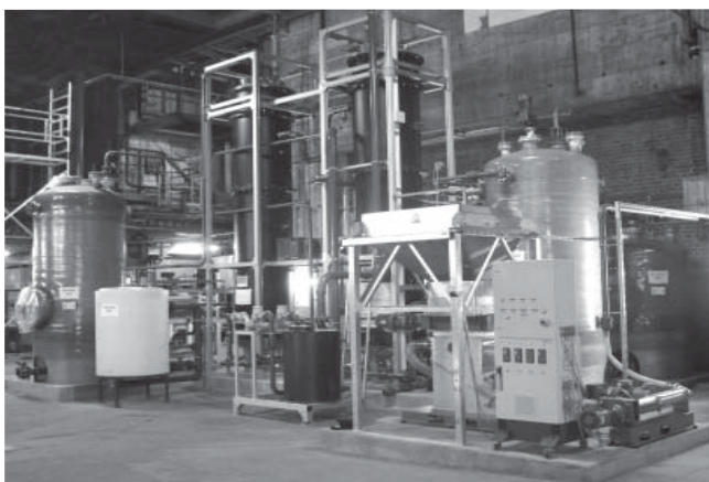
This plant in Stuttgart makes biogas out of waste from wholesale markets.

Others involved in this network project, which goes by the name of ETAMAX, include energy company EnBW Energie Baden-Württemberg and Daimler AG. The former uses membranes to process the biogas generated in the market-place plant, while the latter supplies a number of experimental vehicles designed to run on natural gas. The five-year project is funded to the tune of six million euros by the German Federal Ministry of Education and Research (BMBF). If all the different components mesh together as intended, it is possible that similar plants could in future spring up wherever large quantities of organic waste are to be found. Other project partners are the Fraunhofer Institute for Process Engineering and Packaging IVV in Freising, FairEnergie GmbH, Netzsch Mohnopumpen GmbH, Stulz Wasser- und Prozesstechnik GmbH, Subitec GmbH und the town Stuttgart.