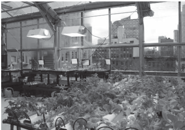
Formation and training site at the Manhattan School for Children (NY, USA).