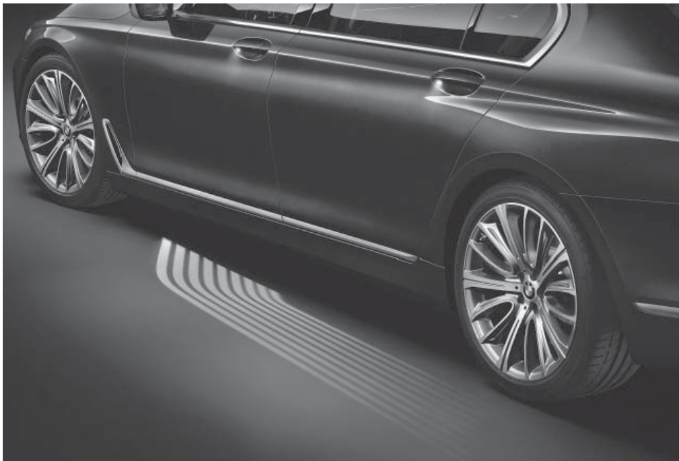
Microlenses project light onto the entry area of the new BMW 7 Series. (© BMW) | Picture in color and printing quality: www.fraunhofer.de/press

The BMW Welcome Light Carpet is now standard equipment on the new BMW 7 Series. “This marks the first time our technology has been applied in a volume market,” Bräuer adds happily. Yet the development team also has its eyes on new application areas. “There is an extremely wide range of possible uses for this type of array lighting, extending from safety technologies and medical applications to mechanical engineering and traditional signal lighting,” he says.