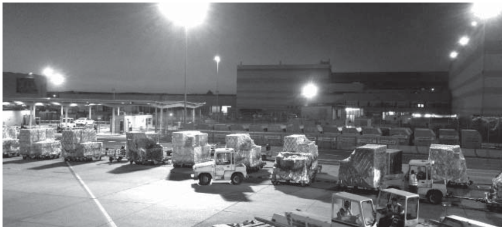
The positioning systems developed in the EU project e-Airport help control processes on airport aprons more efficiently. (© Fraunhofer IFF) | Picture in color and printing quality: www.fraunhofer.de/press

The researchers will be presenting their e-Airport project at the BVL's International Supply Chain Conference in Berlin from October 28 to 30 (Booth P/24).