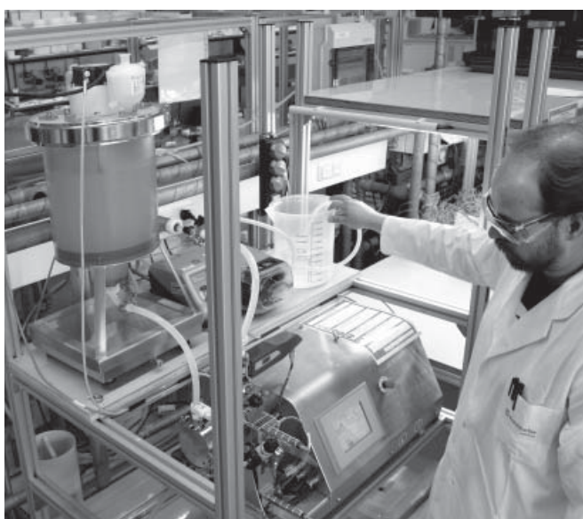
Peptides harvested from rice proteins are sorted by size using a special filtration technique. (© Fraunhofer UMSICHT) | Picture in color and printing quality: www.fraunhofer.de/press

At the end of the peptide production chain is an SME enterprise headquartered in Switzerland and Italy which will bring them to market. However, before reaching supermarket shelves as ingredients in creams and nutritional supplements, the peptides must still undergo a number of tests and analyses, primarily with regard to their tolerability and effectiveness.