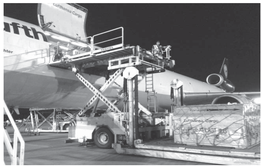
Air freight being loaded. Researchers at the Fraunhofer IFF are working with other partners on a digital fingerprint for security-sensitive air freight in the project ESecLog. This is intended to make tampering with shipments easily detectable in the future. | Picture in color and printing quality: www.fraunhofer.de/press

It will be a while, though, until the system is put to use: Now that the consortium has designed the individual systems, the technologies are in the development stage and should be operational by the end of the year. A test environment is supposed to be built in the coming year to optimize the interaction of the systems. The researchers from the Fraunhofer IFF will be presenting this project at the International Supply Chain Conference in Berlin from October 22 to 24. ESecLog is being funded by the Federal Ministry of Education and Research (BMBF).