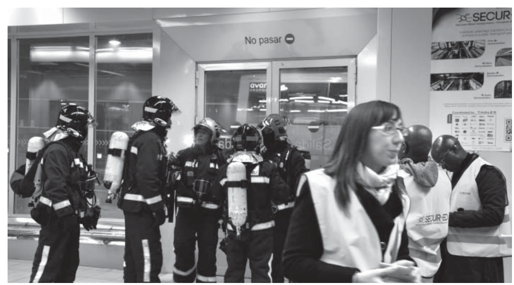
The EU research project, Secur-ED, aims to achieve greater security at Europe's train stations. Here, fire department staff can be seen on a test run in Madrid.

The closing conference of Secur-ED (www.secur-ed.eu) takes place on September 17 in Brussels. In addition, the project will be presented at Future Security 2014, the security research conference in Berlin, from September 16 to 18 (www.future-security2014.de).