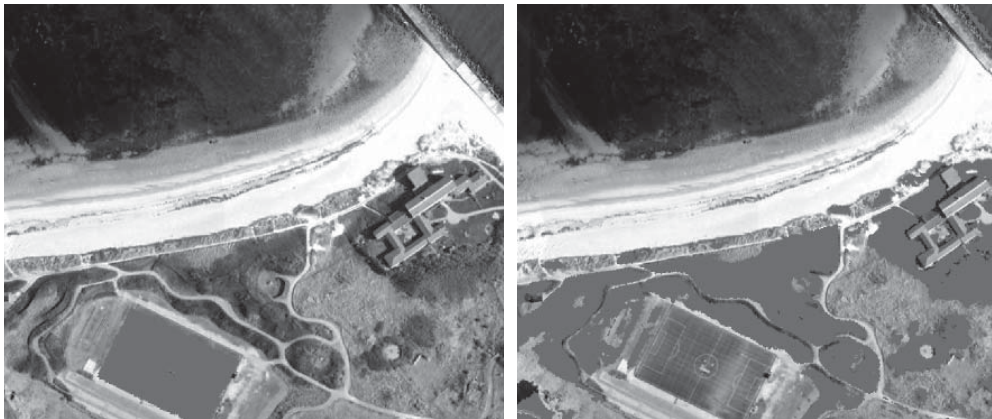
Artificial turf (left) or real vegetation (right)?: The SpectralFinder recognizes the color spectrum of surfaces in real time.

Visitors to the CeBIT joint exhibition booth of the Fraunhofer-Gesellschaft can test the SpectralFinder by moving the camera in front of a material wall, seeing its live recordings on the monitor and applying the software. Objects from the world of mining can be studied, along with things that play a role in environmental monitoring. The scientists will also be presenting their technology in a virtual laboratory. An initial scenario can also be seen at CeBIT.