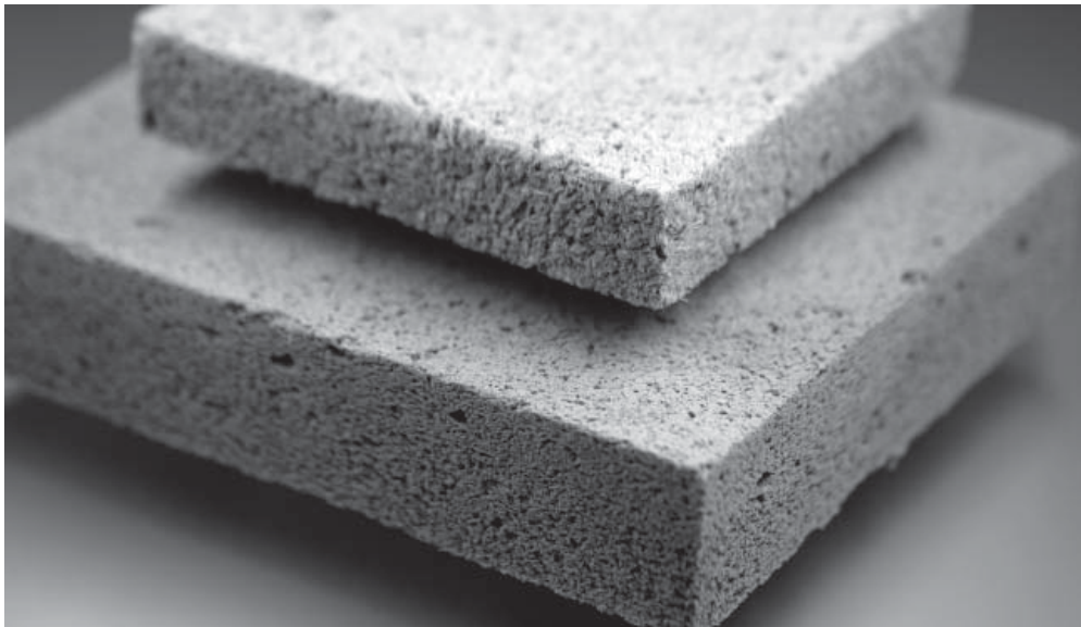
This wood foamed board is an entirely natural product made from sustainable raw materials. (© Fraunhofer WKI) | Picture in color and printing quality: www.fraunhofer.de/press

The Braunschweig-based scientists are currently experimenting with different types of wood to discover which tree species make the best basis for their product. Furthermore, they are working out suitable processes for mass-producing wood foams on an industrial scale. This innovative material could also be used in areas other than insulation, such as packaging. Packing materials made from wood foam would provide a long-term alternative to yet another oil-based product: expanded polystyrene.