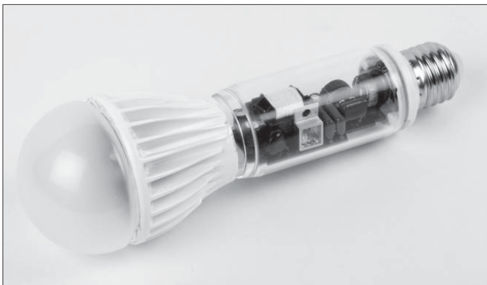
Gallium nitride transistors enable the compact design of this 2090 lumen retrofit LED lamp (exploded diagram for purpose of illustration).

silicon transistor LED lamps available on the market., the scientists were able to increase the light output: while the luminous flux of commercial LED retrofit lamps featuring silicon components is around 1000 lumen (the unit used to measure the light produced), researchers from the IAF have been successful in increasing this to 2090 lumen. "20 percent of energy consumption worldwide can be attributed to lighting, so it's an area where savings are particularly worthwhile. One shouldn't underestimate the role played by the efficiency of LED drivers, as this is key to saving energy. In principle, the higher the light yield and efficiency, the lower energy consumption is. If you think that by 2020 LEDs will have carved out a market share of almost 90 percent, then it is obvious that they play a significant role in protecting our environment," says Kunzer. The researchers will be showcasing a demonstrator of their retrofit LED from April 7-11 at the Hannover Messe, where they can be found at the joint Fraunhofer booth in Hall 2, Booth D18.