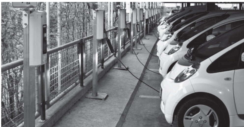
Up to 30 electric vehicles at a time can recharge in Fraunhofer IAO's parking garage. (© Victor S. Brigola/Fraunhofer IAO) | Picture in color and printing quality: www.fraunhofer.de/press

In their living lab, the IAO scientists now plan to create a testing environment that will allow industrial companies, systems providers, public utility companies, communities and distributors to explore the potential of micro grids. Over the next two years, the Micro Smart Grid innovation network is to provide interested parties with an opportunity to work up new kinds of smart grid configurations and operating strategies. Using the Fraunhofer micro smart grid demonstrator, the project partners can test their hardware and software components. They can also investigate options for allowing other consumers to connect to the MSG – whether, for example, to run a building's air conditioning system or to integrate other production facilities. "Our long-term goal is to bring individual local grids together to form a large smart grid," says Rose. Researchers will be presenting a virtual model of their smart grid at the Hannover Messe from April 7-11 at the joint Fraunhofer booth in Hall 2, Booth D18.