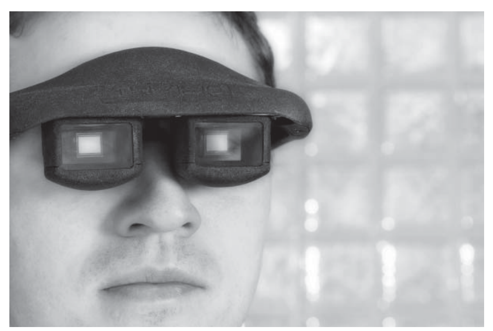
Users can control the display of these data glasses with their eye movements.

As the Society for Information Display celebrated its 50th anniversary, Fraunhofer researchers celebrated winning the Best in Show Award at the world's most important display conference, the SID Display Week, held in Boston, MA in June this year. Those first in line from manufacturing, industry, medical and security sectors are currently exploring possible applications of this new technology.