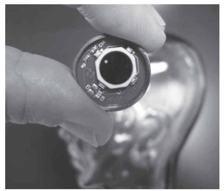
View of the not yet completely enclosed intracranial pressure sensor. (© Fraunhofer IBMT) | Picture in color and printing quality: www.fraunhofer.de/press

even a number of years, without requiring additional surgery. During the Medica trade fair which takes place in Düsseldorf from November 14 to 17, 2012, researchers from IBMT will demonstrate how the sensor functions using a glass model head at the Fraunhofer joint exhibition stand in Hall 10, stand F05. "We will demonstrate the new kind of intracranial pressure sensor from the medical device technology industry, and seek to discuss it with other device manufacturers."