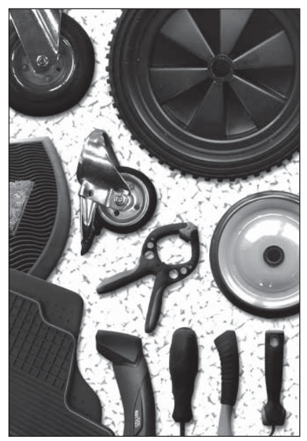
Elastomeric powders can be used in a variety of ways in high-quality materials.

In the "Re-use a Shoe" project, sports gear maker Nike has been collecting used sneakers for a while now, recycled their soles and under the label "Nike Grind", reprocessed them as filler material for sports arenas and running track surfaces. The EPMT compound of the Fraunhofer researchers enables Nike to place new products on the market. As one of its official promotional partners, "Tim Green Gifts" created the first EPMT-based promotional articles under the "Nike Grind" brand, like frisbees, shoehorns and boomerangs. Discussions about using new EPMT compounds in the original portfolio, such as zippers, bag bases and sports equipment, have also been initiated. "We are extremely excited about this collaboration," says Wack.