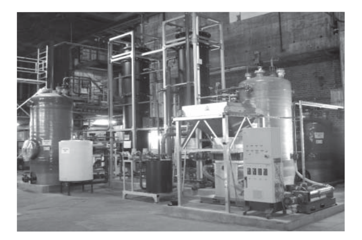
This plant in Stuttgart makes biogas out of waste from wholesale markets.

Others involved in this network project, which goes by the name of ETAMAX, include energy company EnBW Energie Baden-Württemberg and Daimler AG. The former uses membranes to process the biogas generated in the market-place plant, while the latter supplies a number of experimental vehicles designed to run on natural gas. The five-year project is funded to the tune of six million euros by the German Federal Ministry of Education and Research (BMBF). If all the different components mesh together as intended, it is possible that similar plants could in future spring up wherever large quantities of organic waste are to be found. Other project partners are the Fraunhofer Institute for Process Engineering and Packaging IVV in Freising, FairEnergie GmbH, Netzsch Mohnopumpen GmbH, Stulz Wasser- und Prozesstechnik GmbH, Subitec GmbH und the town Stuttgart.